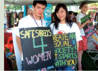
Women's Aid Organisation Refuge Centre for Battered Women and their Children

Under its "Community Development" pillar, YSD supports initiatives and programmes intended to promote the well-being of disadvantaged people, regardless of race, religion, language and ethnicity. YSD organises and supports capacity enhancement programmes that assist the disadvantaged segments of society by enable them to rise out of the shadows from the clutches of poverty and helping them build and maintain better lives and futures. YSD also supports initiatives aimed at increasing awareness of the rights of individuals, especially women and children.