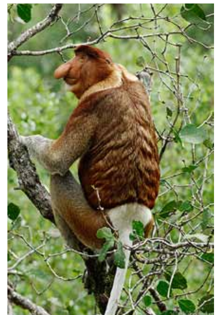
This arboreal species is endangered as they face a single major threat - their habitats are areas which tend to be among the most colonised, farmed, industrialised and least protected by man.