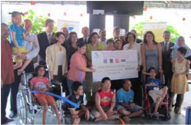
Donors with the children of Persatuan Kanak-Kanak Cacat Taman Megah.

YSD’s donation of RM10,000 was channelled towards the purchase of therapy equipments for the Persatuan Kanak-Kanak Cacat Taman Megah, Petaling Jaya.