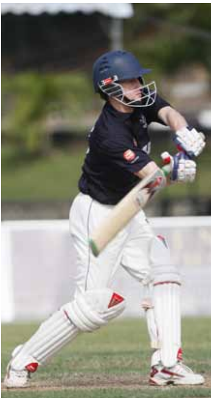
A cricket player in action during the 4th International Youth Cricket Festival 2010 at Royal Selangor Club, Bukit Kiara.