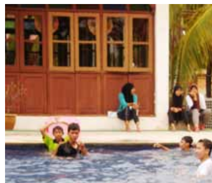
STEP programme participants playing water polo as their recreational activity.