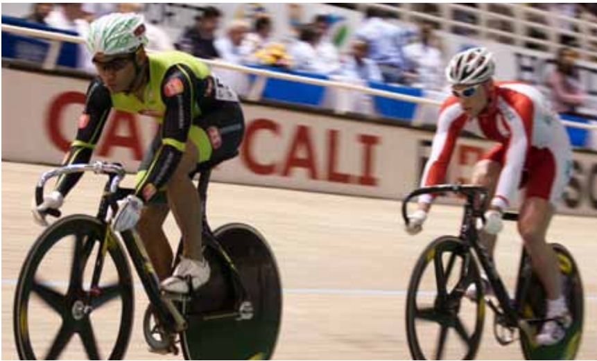
Azizulhasni in action at the World Cup Classics in Cali, Columbia where he won the Gold Medal for the Mens' Kierin Event.