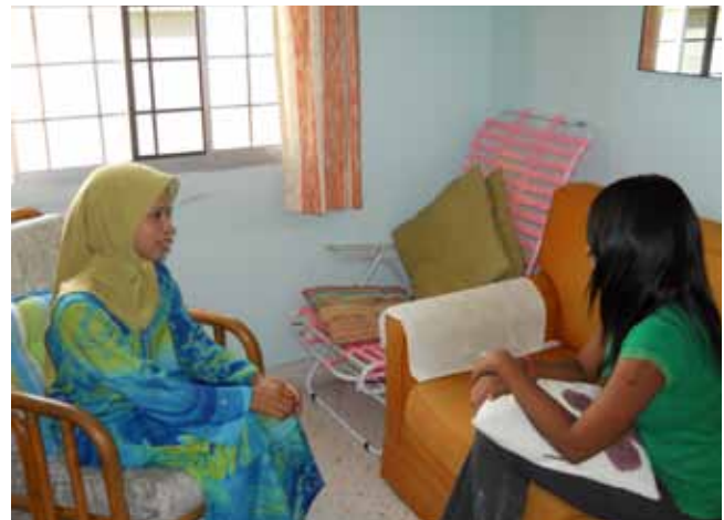
A refugee receiving guidance from a professional counselor at the centre.