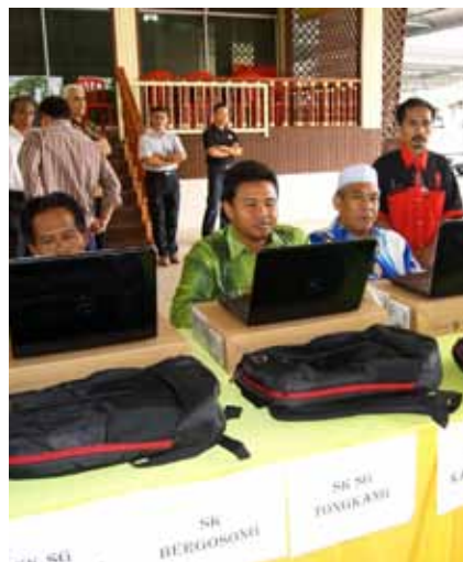
Representatives from the schools testing out their respective laptops.