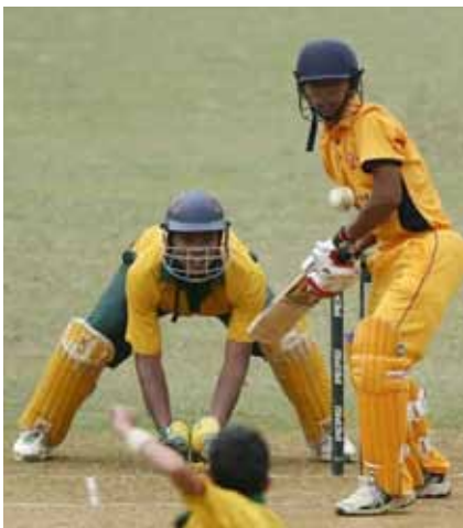
Senior team in action during the IX International Malay Cricket Tournament 2010.