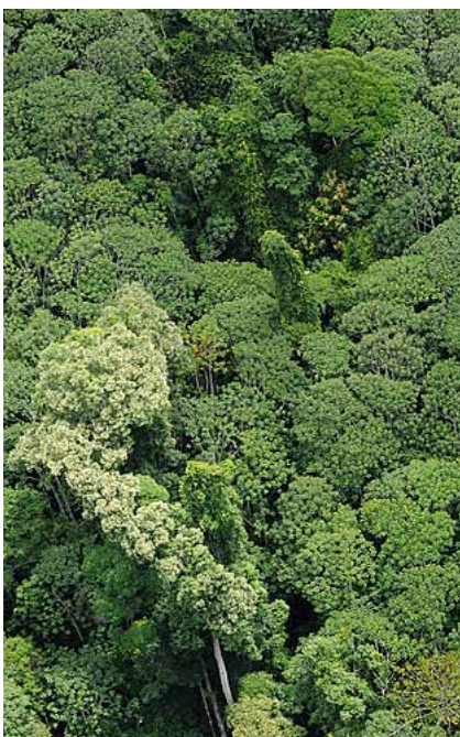
An aerial view of the secondary mixed forest that can be found on-site.