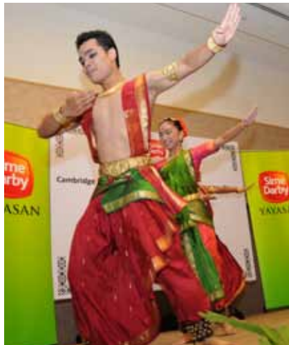
A traditional Indian dance performed skillfully by ASWARA dancers.