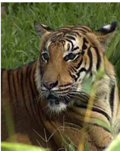
It is estimated that there are only 500 Malayan Tigers remaining in Peninsular Malaysia from 3,000 back in the 1950s.

YSD, Sime Darby Plantation and WWF-Malaysia signed an agreement to carry out a study aimed at assessing selected Sime Darby Plantation estate, which is the Sungai Dingin Estate in Kedah, for the purpose of formulating recommendations in improving sustainable plantation management. The study aims to analyse information on the effects of current activities and operations carried out in oil palm plantations on the wildlife and environment; determine the presence of the Malayan Tiger ( Panthera tigris jacksoni ) and assess its conservation status in and around the selected estate through monitoring of the animal, its habitat and the population of its prey, while determining the levels of human-wildlife conflict and poaching in the plantations, as well as identify the water courses and riparian areas within the estate that contain, or have the potential to contain, significant tiger conservation values.