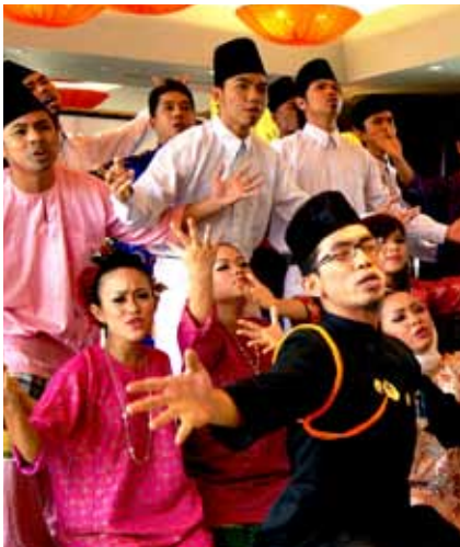
A dramatic preview of a performance that was held during the festival.