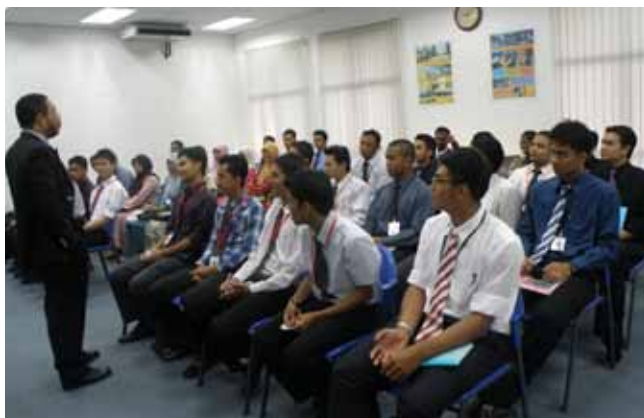
The Skill Enrichment Scholarship provides scholars with not only hands-on vocational training, but also the opportunity to join Sime Darby's workforce.