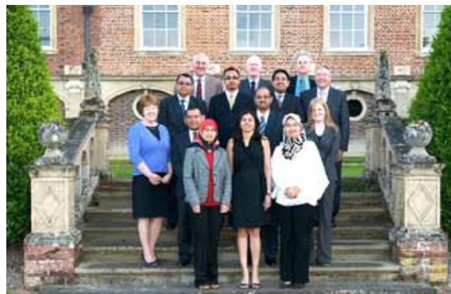
The participants of the Cambridge Public Policy Programme with their supervisors at the University of Cambridge, UK.

During this 10-week programme, 8 selected government officials attended a series of lectures and seminars on important topics relating to public policy, visited various UK government agencies and produced a research paper on public policies with guidance and supervision from leading professors and academicians.