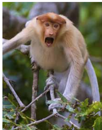
The Proboscis Monkey has partially webbed hands and feet to allow for water mobility.