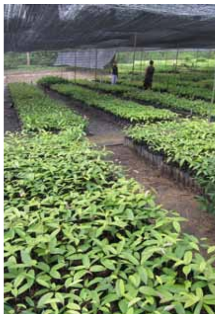
Trees at the age of 6 months are kept in the nursery before it reaches a mature period to be planted at the site.