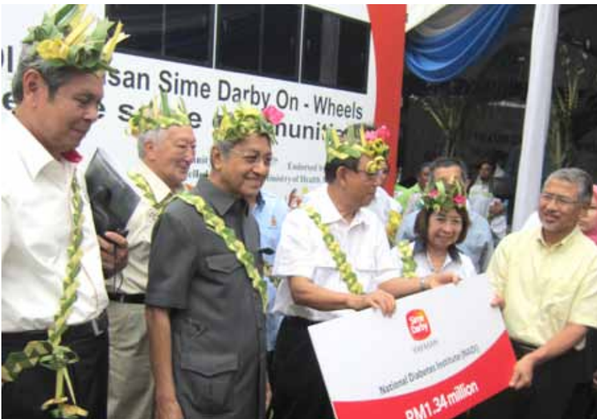
YSD Council Members with Tun Mahathir Mohamad at the launch of NADI-YSD On-Wheels programme.