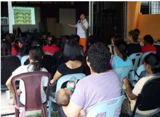
Residents listening to a talk, one of the many activities held by the refuge centre.

for one to three months, and during their stay, they participate in a variety of activities as well as receive employment assistance. The refuge centre officials also accompany these battered women to attend court hearings and even help them make police reports.