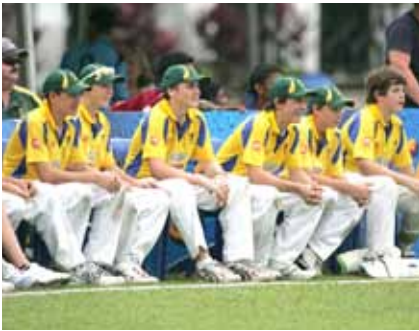
Participants from Australia waiting on the sidelines, cheering for the other teams.

The 4th KL International Youth Cricket Carnival was held at the Royal Selangor Club from 30 July to 1 August 2010. YSD sponsored an amount of RM 60,000 towards the organisation of this prestigious event that saw participation from 24 teams from Pakistan, Sri Lanka, India, Australia and Malaysia.