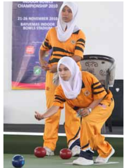
The Malaysian team in action during the Championship.