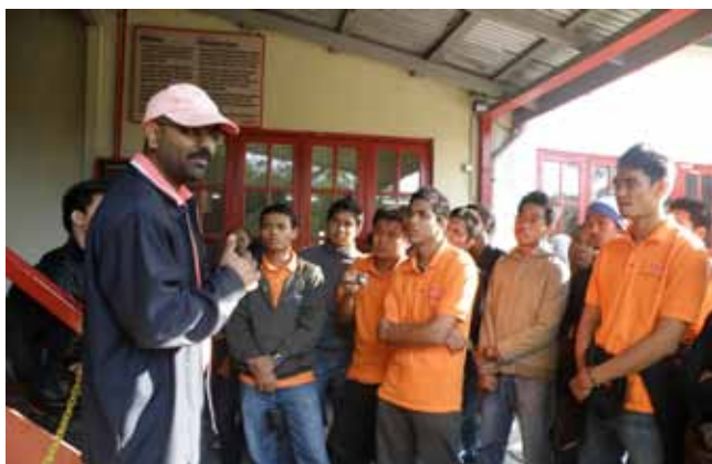
YSD's scholars from the Sime Darby Plantation Academy (SDPA) receiving practical training at one of Sime Darby's plantation estates.

Students who are vocationally inclined may pursue technical courses at diploma and certificate levels at Sime Darby Plantation Academy (SDPA), Sime Darby Nursing and Health Sciences College (SDNC) or Sime Darby Industrial Academy (SDIA).