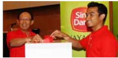
Launch of Tabung Leukemia YSD & YSD Outstanding Achiever Award - Azizulhasni Awang 30 March