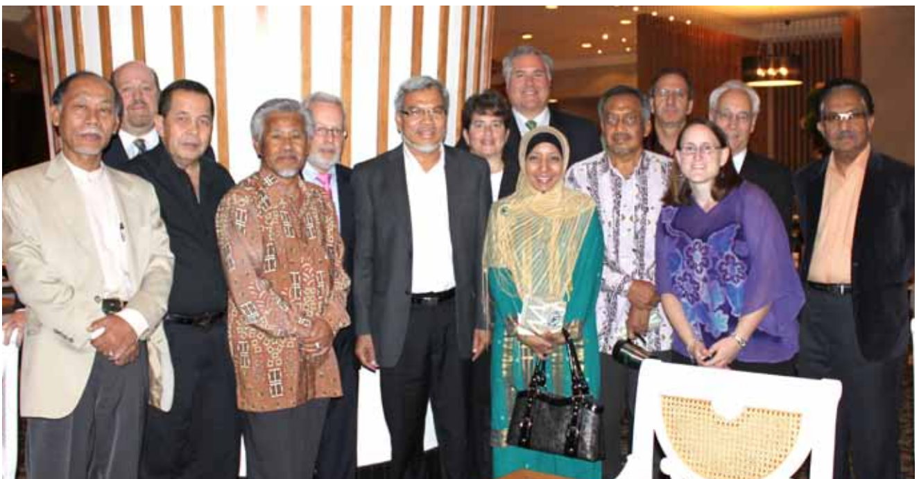
The Ohio University delegation meeting with former Tun Razak Chairholders in Kuala Lumpur in 2010.