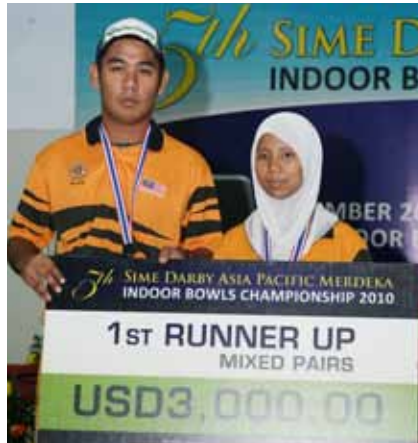
The Malaysian team succeeded in winning the Silver Medal of the Mixed Pairs category.

and Mixed Pairs Categories. The support for the Malaysian Lawn Bowls Federation's 5th Asia Pacific Merdeka Singles & Mixed Pairs Championship 2010 is proof of YSD's commitment towards providing opportunities to youth and boosting their development in the area of sports, which would also enhance their overall development and increase their chances of future success in achieving their aspirations.