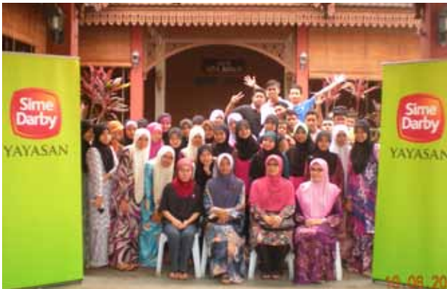
Students attending "Kem Pecutan Prestasi PMR & SPM 2011" from 6 to 10 June 2011.

The YSD School Excellence Twinning Programme (STEP) is another programme which is aimed at creating and nurturing good school culture and an environment that promotes high performance and academic excellence. The pioneer programme was launched on 2 April 2011 with potential students and teachers from the two rural schools attending a one-week attachment at one of the top Sekolah Berprestasi Tinggi in Malaysia.