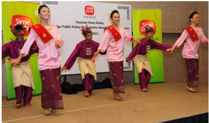
ASWARA dancers performing a traditional Malay dance.

adults, by offering workshops and interactive games and talks. YSD's contribution brings a dance tour across 6 venues in Peninsular Malaysia, involving approximately 20 of ASWARA's best dance graduates and students, as well as its renowned teaching staff. The concerts are free to the public. The workshops are free for school-going youth, with a minimal fee for adults.