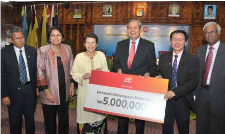
YSD Council Members and the representatives from UKM with the mock cheque during the launch of the UKM-YSD Chair for Climate Change.

climate forecasts, all of which would be important and useful for the planning and management of Sime Darby’s plantation operations. The same is true for projects to examine the impact of climate change on ecosystems in palm oil plantations or to develop ecological approaches to pest control. Thus, support for the Chair would result in knowledge and technologies which would enable Sime Darby to become more competitive while at the same time minimizing the impact of its business activities on the environment.