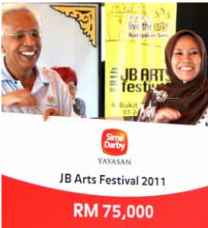
Dato' Seri Utama Shahrir Abdul Samad accepting the mock cheque from Puan Yatela Zainal Abidin.

The JB Arts Festival is the only festival of its kind in Malaysia. Organised by the Johor Society of the Performing Arts, the 8th edition of the festival is a platform where local and international performers, both traditional and modern, meet, perform and exchange knowledge with the audience, as well as among each other. Between 21 to 24 July 2011, audiences were wowed by the plethora of creativity and artistry shown during this festival of the senses.