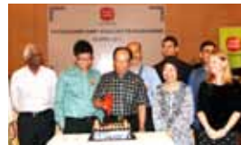
YSD Scholar's Reunion Dinner 25 April