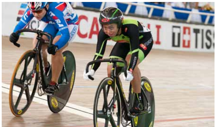
Fatehah in action at the cycling track during the World Cup Classics in Cali, Columbia held on 16 to 18 December 2010.