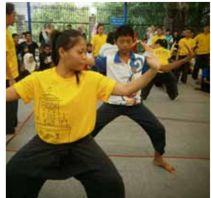
Learning by example, a young boy taking pointers from an ASWARA dancer during the workshop.