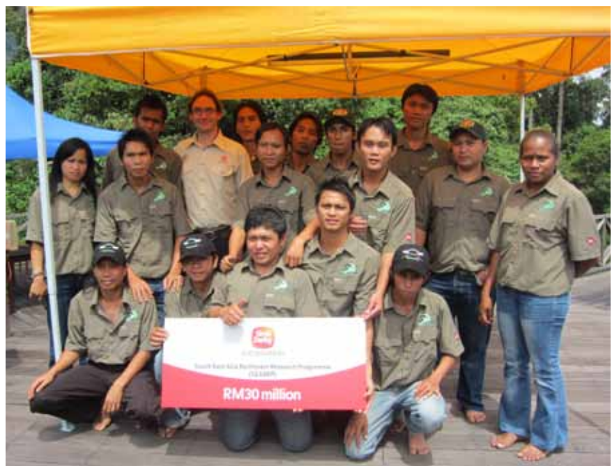
The researchers and staff of the SAFE project.