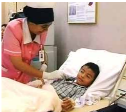
A young leukemia patient being treated by a nurse at SDMC.