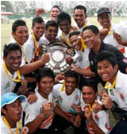
Athletes of the Malay Cricket Association of Malaysia posing proudly with their trophy and medals.

The annual tournament hosted by the Malay Cricket Association of Malaysia (MCAM) brought together different nations in the spirit of healthy competition and the love of cricket. The 9th International Malay Cricket Tournament saw for the first time, since their inaugural meet in 1999, three teams participating which were the Malaysian Malays, the South African Malays and the Singaporean Malays.