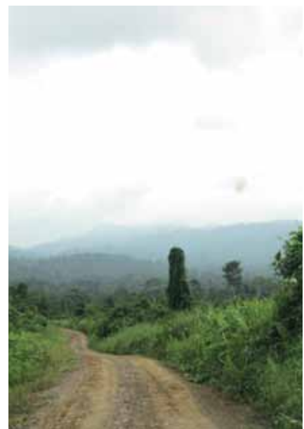
View of the highly degraded Northern Ulu Segama Forest Reserve today, due to excessive logging in the mid 90s.