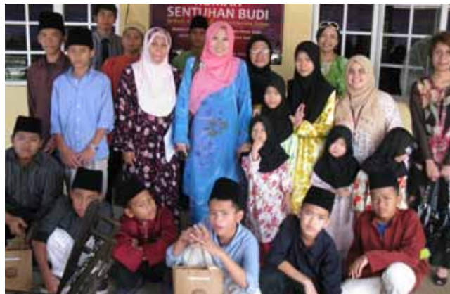
YSD staff with the residents of Rumah Sentuhan Budi.

YSD brought smiles to the faces of the orphans at Rumah Sentuhan Budi when we donated RM1,250 worth of clothes for Hari Raya.