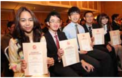
YSD Scholarship Award Ceremony 2010 8 July