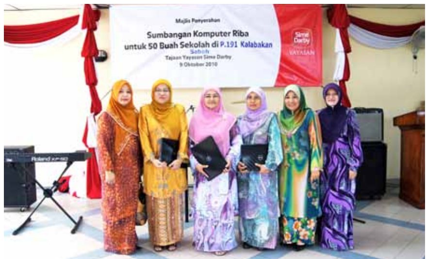
Teachers with their newly acquired laptops.

due to poor accessibility to current communication tools and equipments such as laptops and internet connection. With YSD's support, latest information from the relevant ministries and support offices of Malaysia will be within reach and be useful for the headmaster/ principal and administration staff, who will also be able to keep their teachers and students abreast of up-to-date developments and information that is relevant to their fields of study.