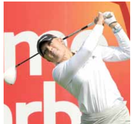
Natalie Gulbis proving her worth as a professional golfer during the inaugural Sime Darby LPGA 2010.