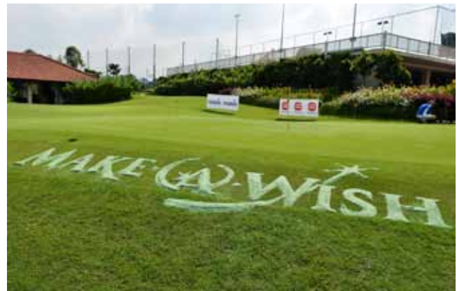
The charity golf tournament under the Make-A-Wish Foundation was held at Kuala Lumpur Golf and Country Club (KLGCC).

YSD contributed RM15,000 as the Gold sponsor for this charity golf tournament. The funds donated will be used to fulfill the wishes of terminally ill children suffering from life threatening diseases.