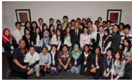
Scholars Development Programme Australia 30-31 October