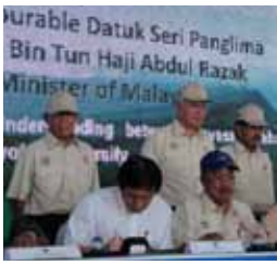
Launch of SAFE Project 27-29 January