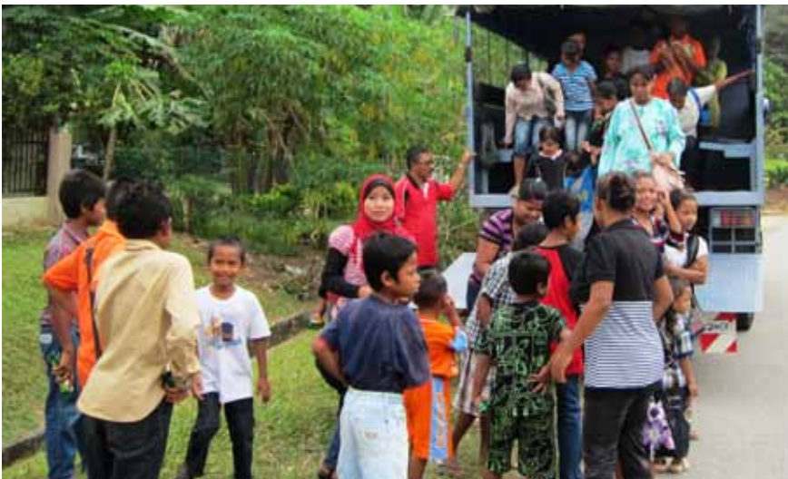
The Orang Asli community arriving at the 'NADI-YSD On-Wheels' roadshow.

an effort to bring awareness to these communities. These roadshows educates the Orang Asli community through access to a mobile library providing books, CD/DVD and internet access, health talks, practical tips to help manage diabetes, giving free health screenings, counseling for those found to have diabetes and also exhibitions. To date, four roadshows have took place, and the programme managed to screen and benefit over 600 Orang Asli.