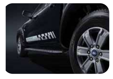
Matte Ranger Side Decal

Fend off debris with robust protection and rugged design.