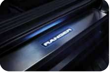
LED Ranger Scuff Plate

Take functionality up a notch with secure holders, available for both the driver & passenger.