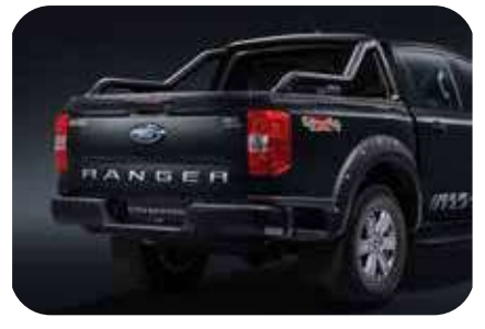
Matte Black Sports bar & Ranger Rear Decal

A stylish and prominent vinyl decal that adds a touch of personality.