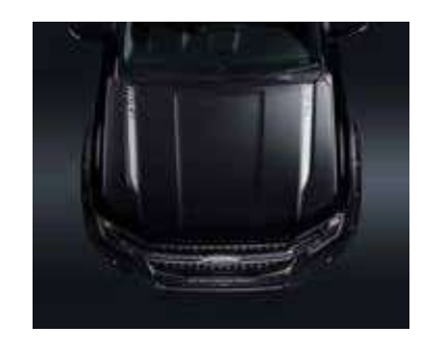
Matte Sports Hood Decal

A durable accessory with a sleek matte black finish, ideal for mounting lights, flags, or other gear.