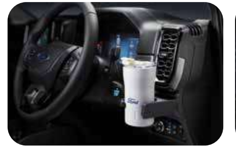
Pull-out Cup Holder

Grace the face of your Ranger with a revamp, giving it some added character.