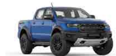
Ford Performance Blue