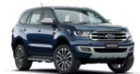
Deep Crystal Blue