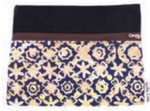
PNP 02 RECTANGLE FLAT POUCH (19.4 x 15 cm)

Made from upcycled fabric and batik, each coin purse is unique and beautifully evergreen.