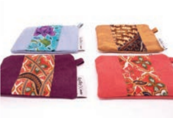
PNP 01 BATIK COIN PURSE (12 x 9 cm)

Made from upcycled fabric and batik, each coin purse is unique and beautifully evergreen.